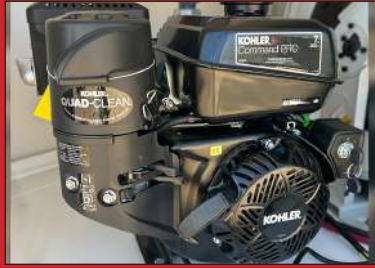
Elec. Start Gas Engine