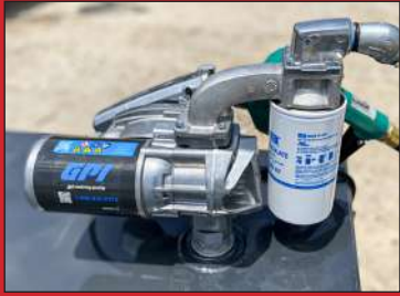
20 GPM Electric Pump