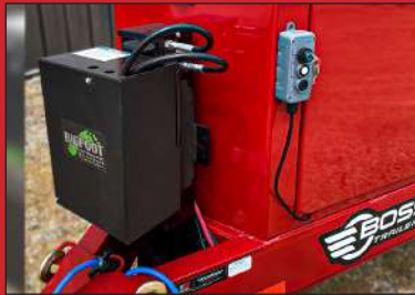
12K Hydraulic Jack