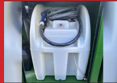
75 Gal. DEF Tank