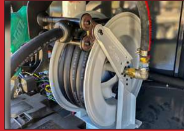
Retractable Hose Reel