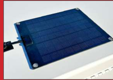
7 Watt Solar Panel