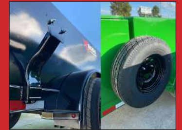
Spare Mount & Tire