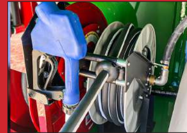
DEF Retractable Reel