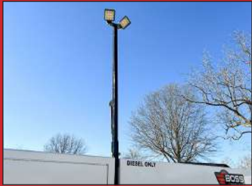
5' High Light Tower