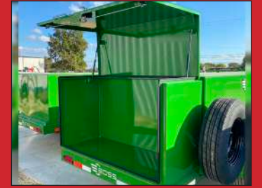
Rear Enclosed Cabinet