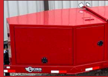
Front Enclosed Cabinet