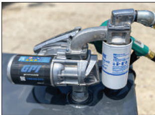
20 GPM Electric Pump