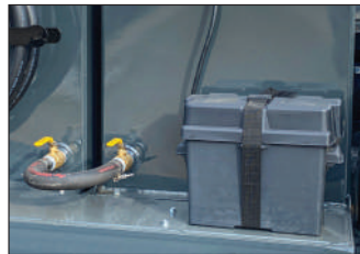
12V Battery in Box